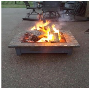
Screen Off - Bad Fire

Screens should be left in place while fire is burning to prevent embers from flying and possibly igniting grass, leaves or other material.